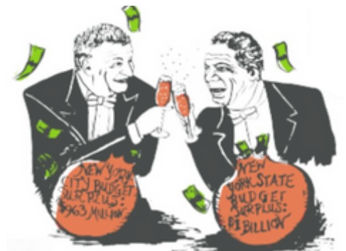
COVER ART BY BECCA GLASER